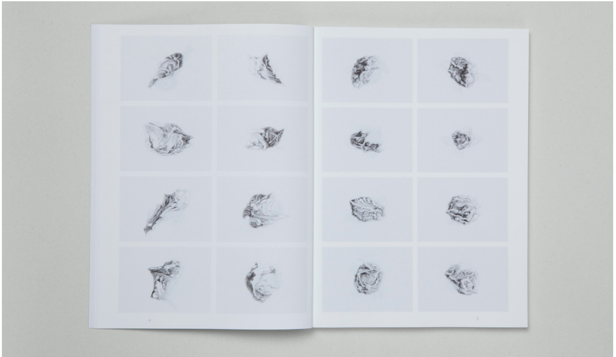
x Points of View contains five series of drawings from objects, observed from different angles. - 1 Point of View (160 glue stains from 1 angle)