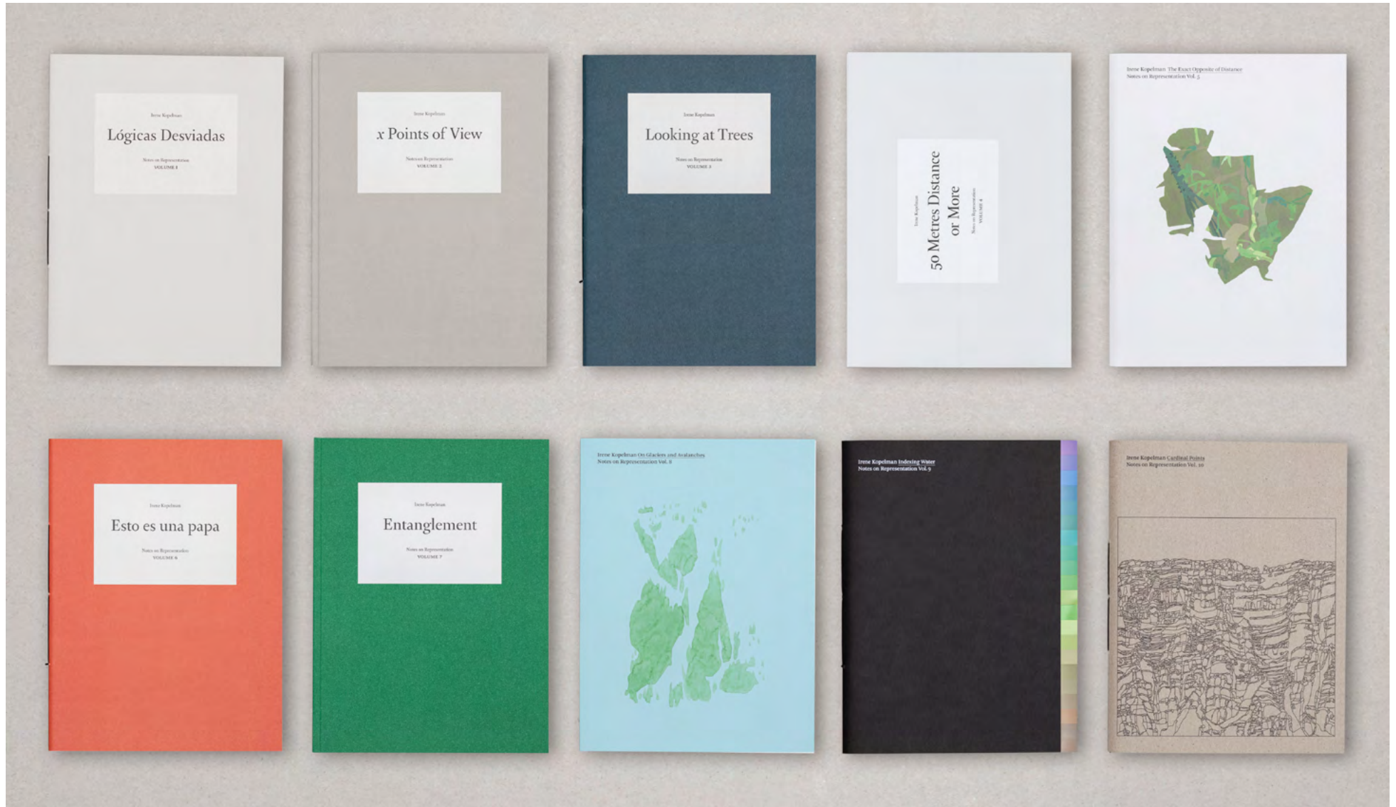
Box with a complete set of 10 volumes of Notes on Representation (2006–2019) by Irene Kopelman. Since 2006 these publications, with visual and written explorations around particular topics, have been an essential part of Kopelman’s practice and give insight into investigative and analytical drawing as a tool for understanding.